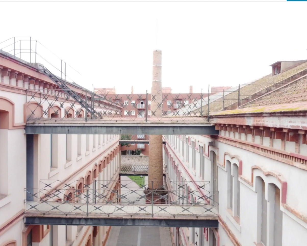
Can Marfà. Museu de Mataró. A SYMBOL OF THE CITY'S PRODUCTIVE IDENTITY.